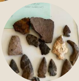
Cleaning and Collections Care