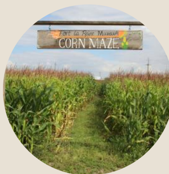
Yard and Garden Maintenance