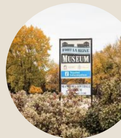
Membership & Partnerships

Contact info@fortlareinemuseum.com for more information or to request a phone call.