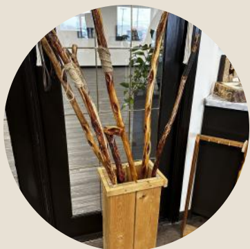
Woodworking and buildings projects