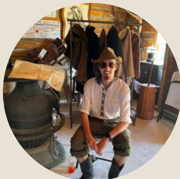
Tours and historical re-enactment